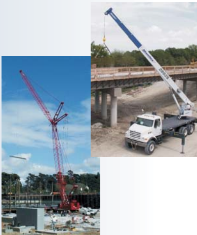
Applications on any size mobile crane