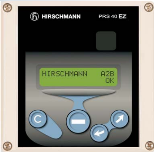
PRS 40 EZ Console with A2B display

The PRS 40 EZ's flexible design allows for monitoring single or multiple sensor inputs in wireless and hardwired applications. The system can monitor up to two wireless and one hardwired sensor at the same time, giving the operator the versatility to combine wireless and hardwired sensors. In wireless applications the PRS 40 EZ utilizes Frequency Hopping Spread Spectrum Technology (FHSS) which transmits on one of 25 different channels to ensure accurate and consistent reception of data. FHSS also provides additional protection against interference common to construction job sites.