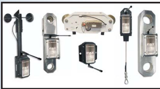
PRS 40 EZ Sensor Options

The PRS 40 EZ's flexible design allows for monitoring single or multiple sensor inputs in wireless and hardwired applications. The system can monitor up to two wireless and one hardwired sensor at the same time, giving the operator the versatility to combine wireless and hardwired sensors. In wireless applications the PRS 40 EZ utilizes Frequency Hopping Spread Spectrum Technology (FHSS) which transmits on one of 25 different channels to ensure accurate and consistent reception of data. FHSS also provides additional protection against interference common to construction job sites.