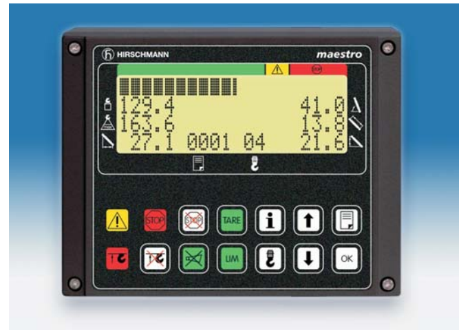
Hirschmann maestro Console

The Hirschmann maestro is an economical upgrade solution for many of the existing PAT load moment indicators that are currently in the field and in need of parts or repair. The Hirschmann maestro provides crane owners with a combination of the latest technology while incorporating many of the existing proven sensors and components. All set up is done through the user-friendly operator's console, with no costly and time consuming re-calibration.