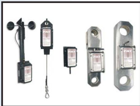
PRS 80 EZ sensor options