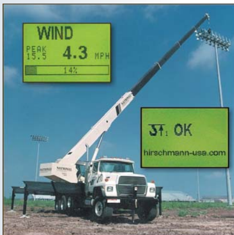
PRS 80 EZ A2B and wind speed displays

The PRS 80 EZ's flexible design allows for monitoring single or multiple sensor inputs. The sensor inputs are displayed on a large back-lit graphic display which is capable of displaying up to seven sensors at one time. The PRS 80 EZ utilizes Frequency Hopping Spread Spectrum Technology (FHSS) which transmits on one of 25 different channels to ensure accurate and consistent reception of data. FHSS also provides additional protection against interference common to construction job sites.