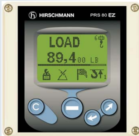
PRS 80 EZ console and load display